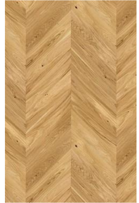
Chevron Oak - Burlywood Brushed, matt-lacquered Grading: Family Colour: natural Bevel: 4-sided, Tongue & Groove Art.no.: BKE023C -Heritage Series 725 x 130 x 14/2.5 mm