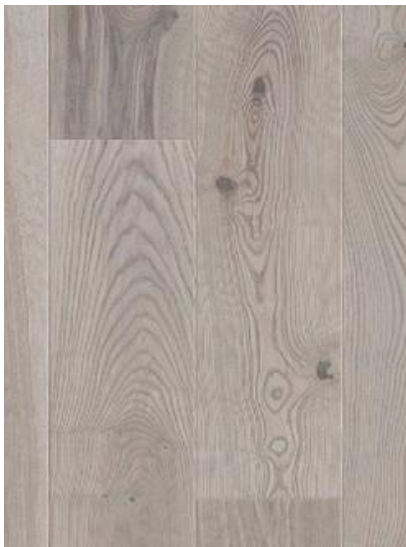
1-Strip Ash - Mink Brushed, matt-lacquered Grading: Natural Colour: light grey Bevel: 4-sided Art.no.: BKE039 - Allure Series 2,200 x 180 x 14/2.5 mm