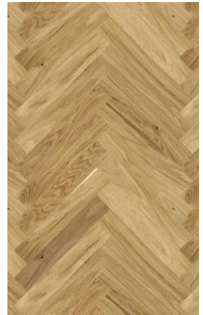
Herringbone Oak - Burlywood Brushed, matt lacquered Grading: Family Colour: natural Bevel: 4-sided, Optilock-Click Art.no.: BKE023H - Heritage Series 660 x 110 x 14/2.5 mm