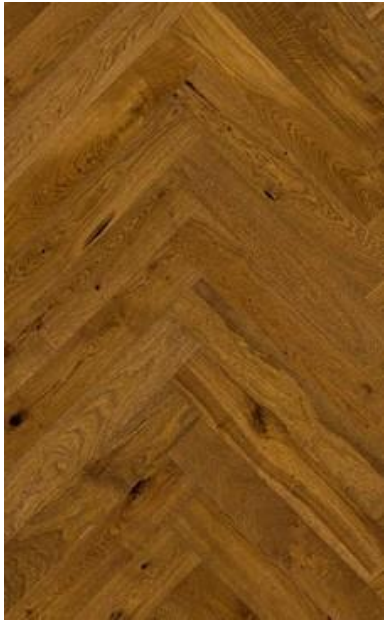
Herringbone Oak - Ginger Brushed, matt lacquered Grading: Country Colour: cognac Bevel: 4-sided, Optilock-Click Art.no.: BKE007H - Heritage Series 725 x 130 x 14/2.5 mm