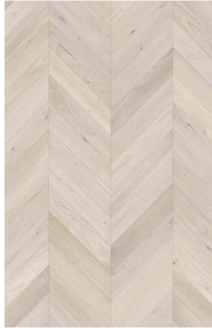
Chevron Oak - Brandy Brushed, matt-lacquered Grading: Family Colour: light grey Bevel: 4-sided, Tongue & Groove Art.no.: BKE050C -Heritage Series 725 x 130 x 14/2.5 mm