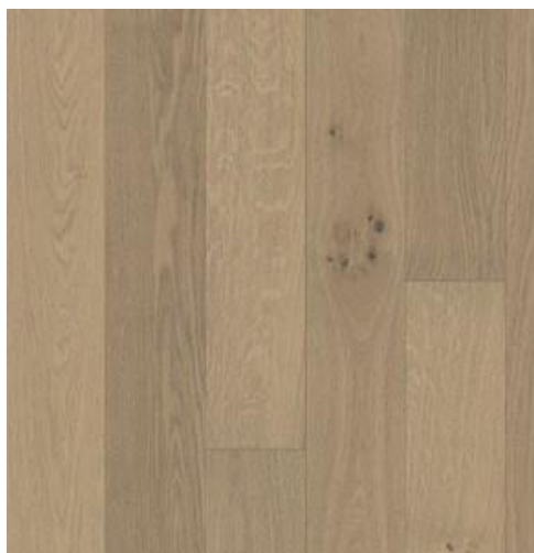
OAK NOUVEAU WHITE