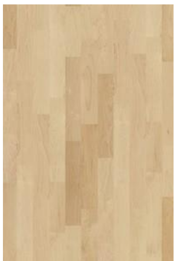
HARD MAPLE TORONTO