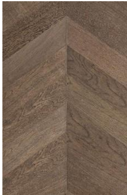
CHEVRON OAK CINNAMON Matt Lacquer - Brushed Grading: Family Colour: natural Bevel: 4-sided, Tongue & Groove 15 X 90 X 485 MM