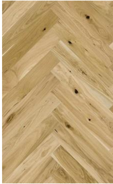
Herringbone Oak - Tan Brushed, oiled Grading: Country Colour: natural Bevel: 4-sided, Optilock-Click Art.no.: BKE066H - Heritage Series 725 x 130 x 14/2.5 mm