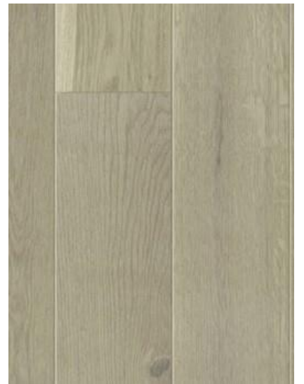
1-Strip Oak - Desert Grey Brushed, matt lacquered Grading: Country Colour: grey brown Bevel: 2-sided Art.no.: BKE090 - Natur Series 2,200 x 180 x 14/2.5 mm