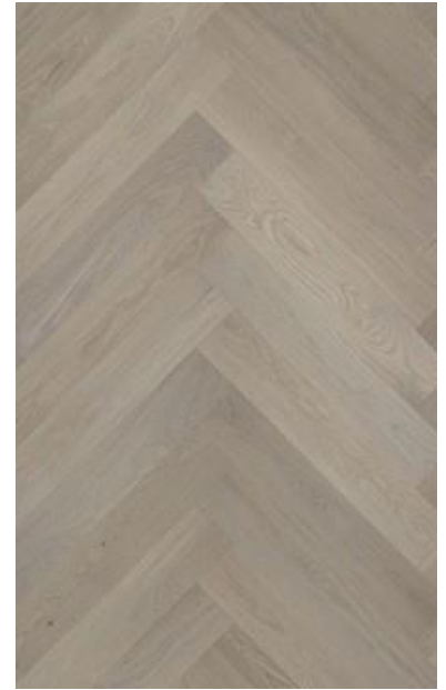
Herringbone Oak - Smokey Grey Brushed, matt-lacquered Grading: Family Colour: light grey Bevel: 4-sided, Optilock-Click Art.no.: BKE010H - Heritage Series 725 x 130 x 14/2.5 mm