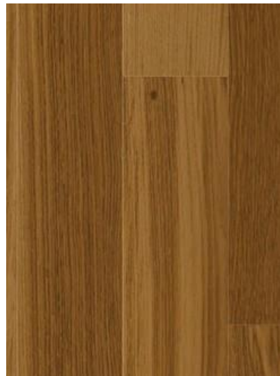
1-Strip Oak - Dark Sand Brushed, matt-lacquered Grading: Natural Colour: cognac Bevel: 4-sided Art.no.: BKE077 - Natur Series 2,200 x 180 x 14/2.5 mm