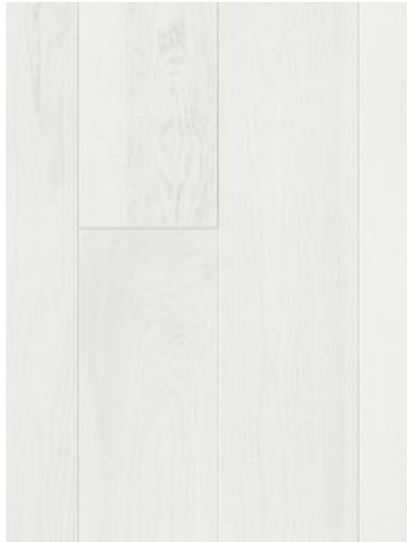
1-Strip Ash - Cloud Brushed, matt-lacquered Grading: Family Colour: extra white Bevel: 4-sided Art.no.: BKE014 - Allure Series 2,200 x 180 x 14/2.5 mm