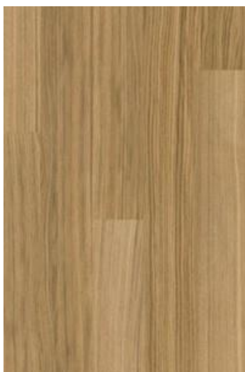
PURE OAK WIDE