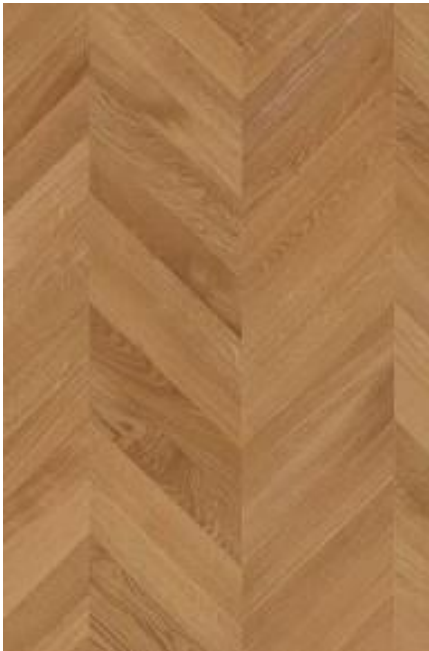
CHEVRON OAK NATURAL Lacquer - Brushed Grading: Family Colour: natural Bevel: 4-sided, Tongue & Groove 15 X 90 X 485 MM