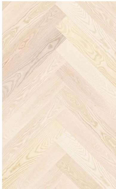
Herringbone Ash - Fortune Cookie Matt lacquered Grading: Select Colour: cream white Bevel: 4-sided, Optilock-Click Art.no.: BKE043H - Heritage Series 725 x 130 x 14/2.5 mm