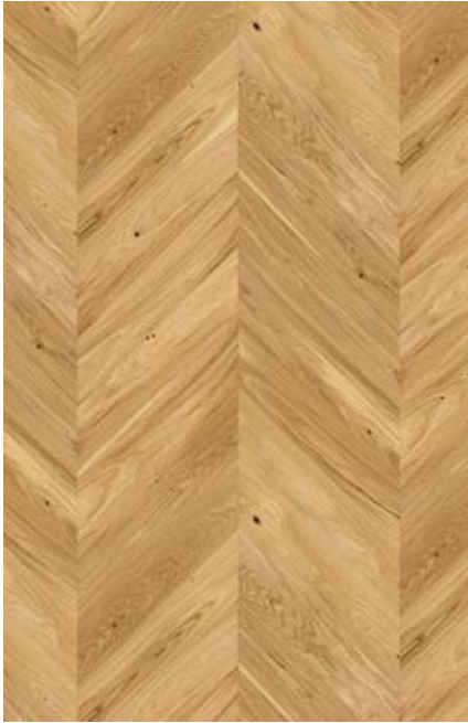
Chevron Oak - Champagne Brushed, oiled Grading: Family Colour: natural Bevel: 4-sided, Tongue & Groove Art.no.: BKE048C -Heritage Series 725 x 130 x 14/2.5 mm