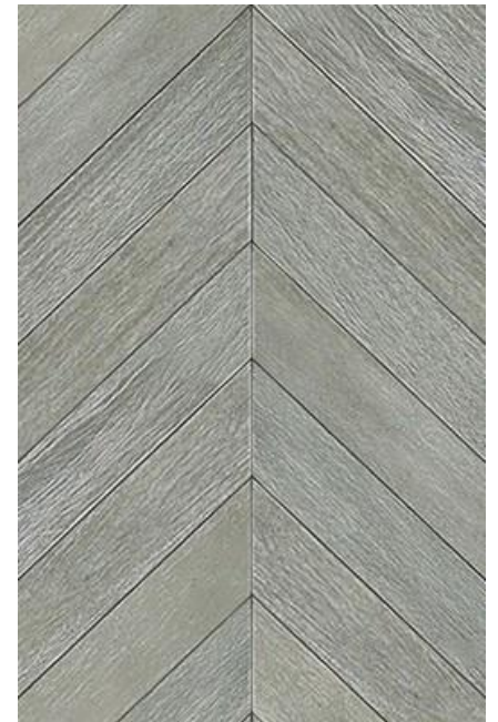
CHEVRON English Grey Matt Lacquer - Brushed Grading: Family Colour: natural Bevel: 4-sided, Tongue & Groove 14/3mm x 92mm x 810mm