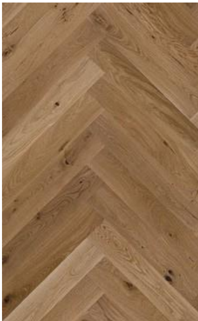
Herringbone Oak - Croissant Brushed, oiled Grading: Country Colour: light brown smoked Bevel: 4-sided, Optilock-Click Art.no.: BKE075H - Heritage Series 725 x 130 x 14/2.5 mm