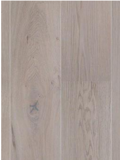
1-Strip Oak - Abalone Brushed, matt lacquered Grading: Various Colour: light grey Bevel: 2-sided Art.no.: BKE037 - Allure Series 2,200 x 207 x 14/3.2 mm