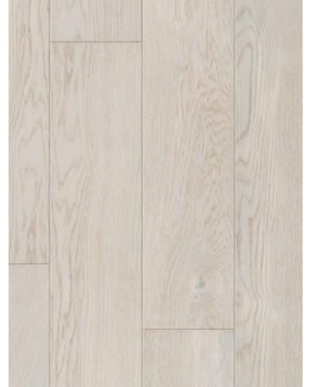
1-Strip Oak - Timberwolf Brushed, matt-lacquered Grading: Various Colour: creme white Bevel: 4-sided Art.no.: BKE027 - Allure Series 2,200 x 180 x 14/2.5 mm